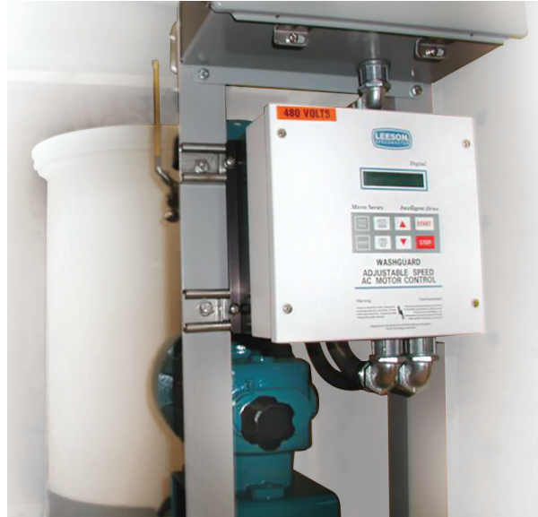
Remote Control Variable Speed Driven Chemical Dosing System