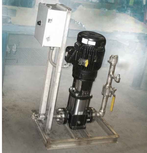
Remote Control Marine Tank Wash Pump