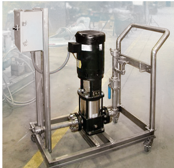
Wash Pump Cart